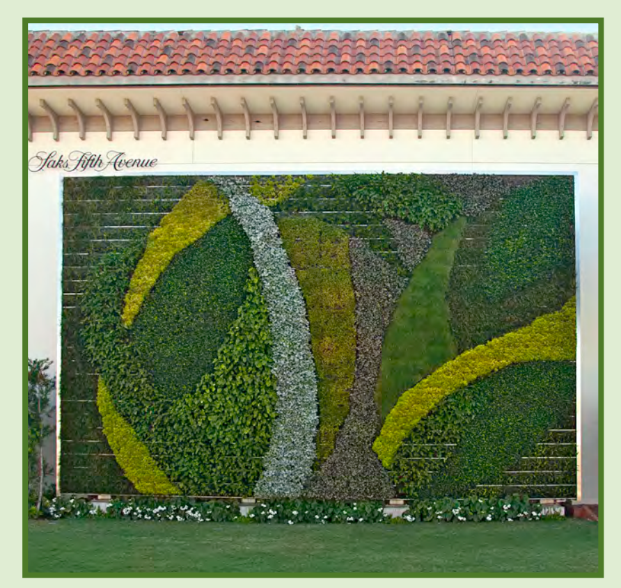
Living Wall: The Living Wall is a vertical garden that was part of the 2011 Worth Avenue restoration project. It contains eleven species and over ten thousand plants.