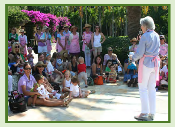
Garden Day: The Garden Club, in partnership with the Four Arts Children's library, teaches, reads and provides a scavenger hunt for all to enjoy biennially.