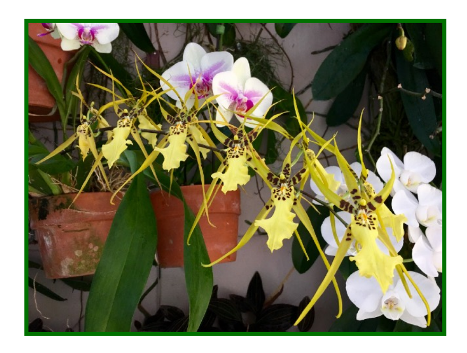
Brassidium, a gift from a friend about 10 years. It has been divided a few times.

A purchase of a seedling at the OSPBs quite a few years ago, this cattleya has grown happily ever since I attached it to a tree.