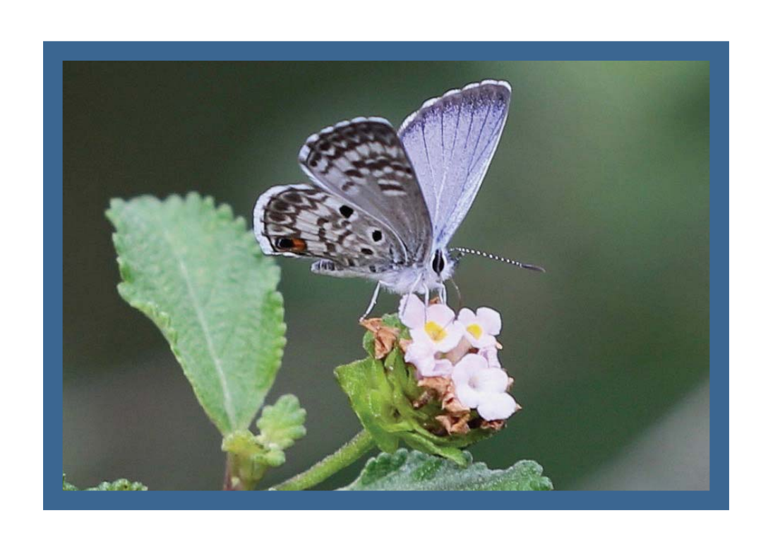
Lantana (Involucrata) Miami Blue (Cyclargus thomasi) by Tim Norriss