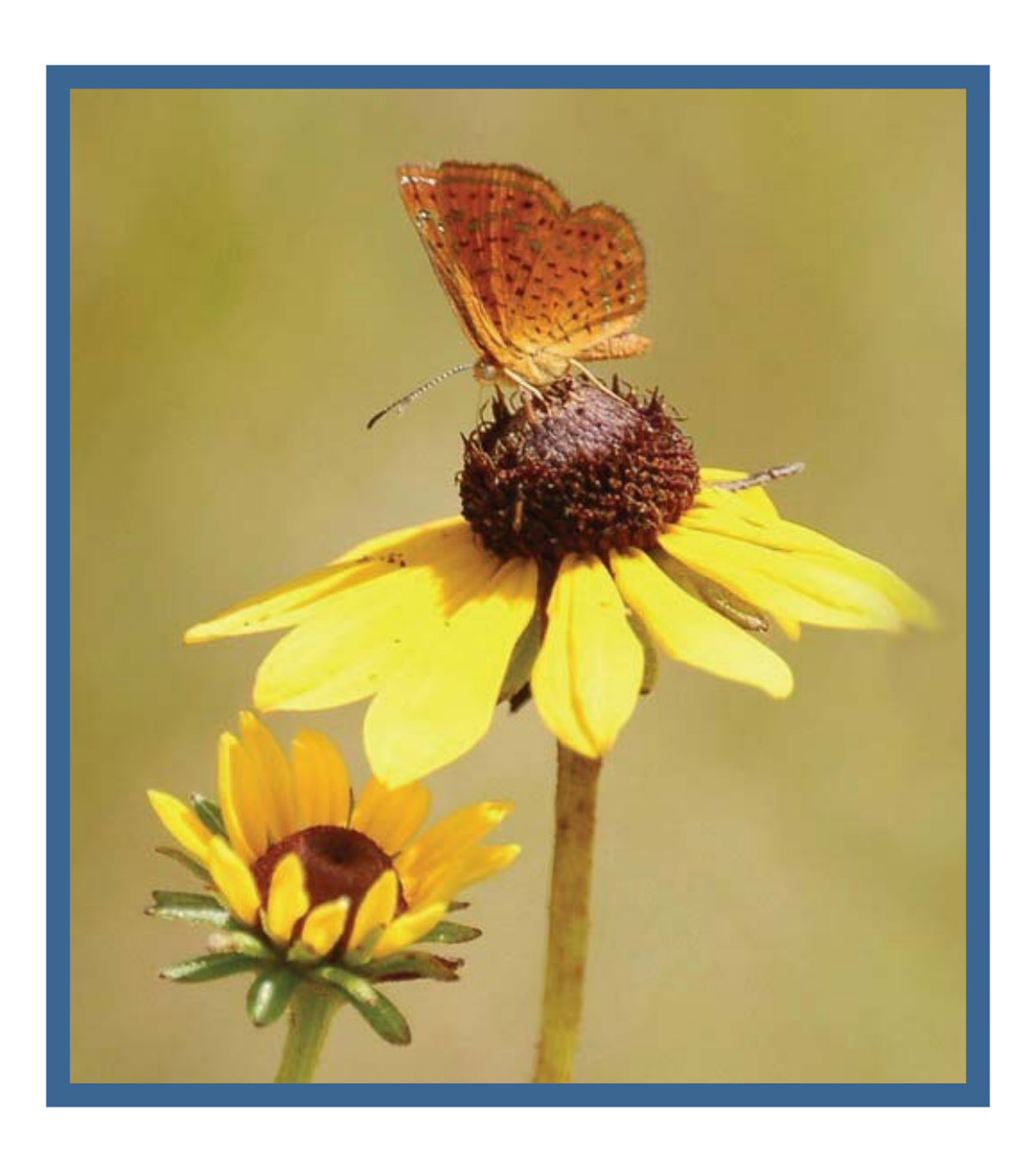
Black-eyed Susan (R. birta var. floridana) Little Metalmark