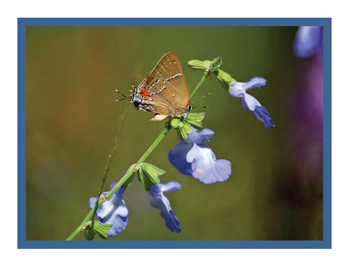
Blue Sage (Salvia azurea) White-M Hairstreak by Barbara Woodmansee