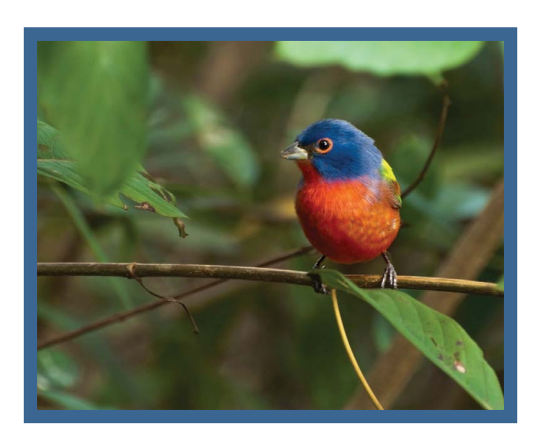
Painted Bunting