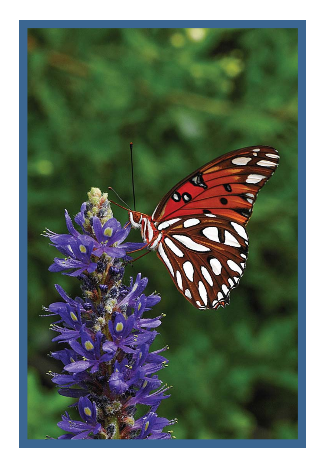
Pickerel Weed (Pontederia cordata) & Gulf Fritillary