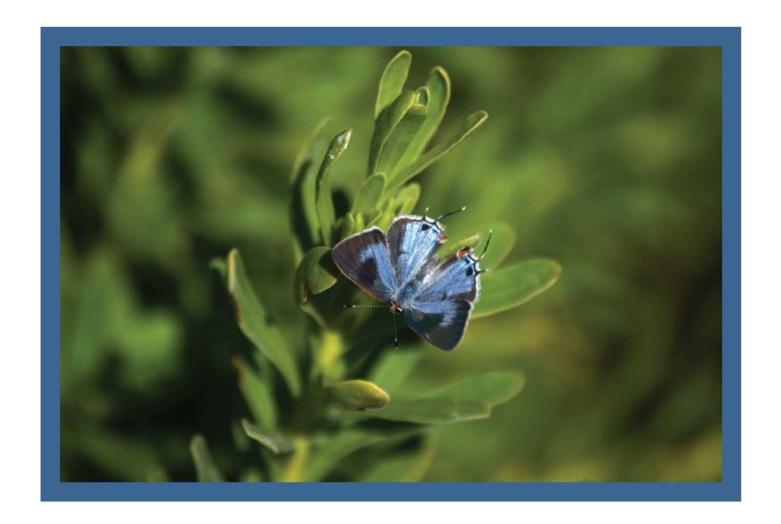
Baycedar ( Suriana maritima) Martial Scrub-hairstreak