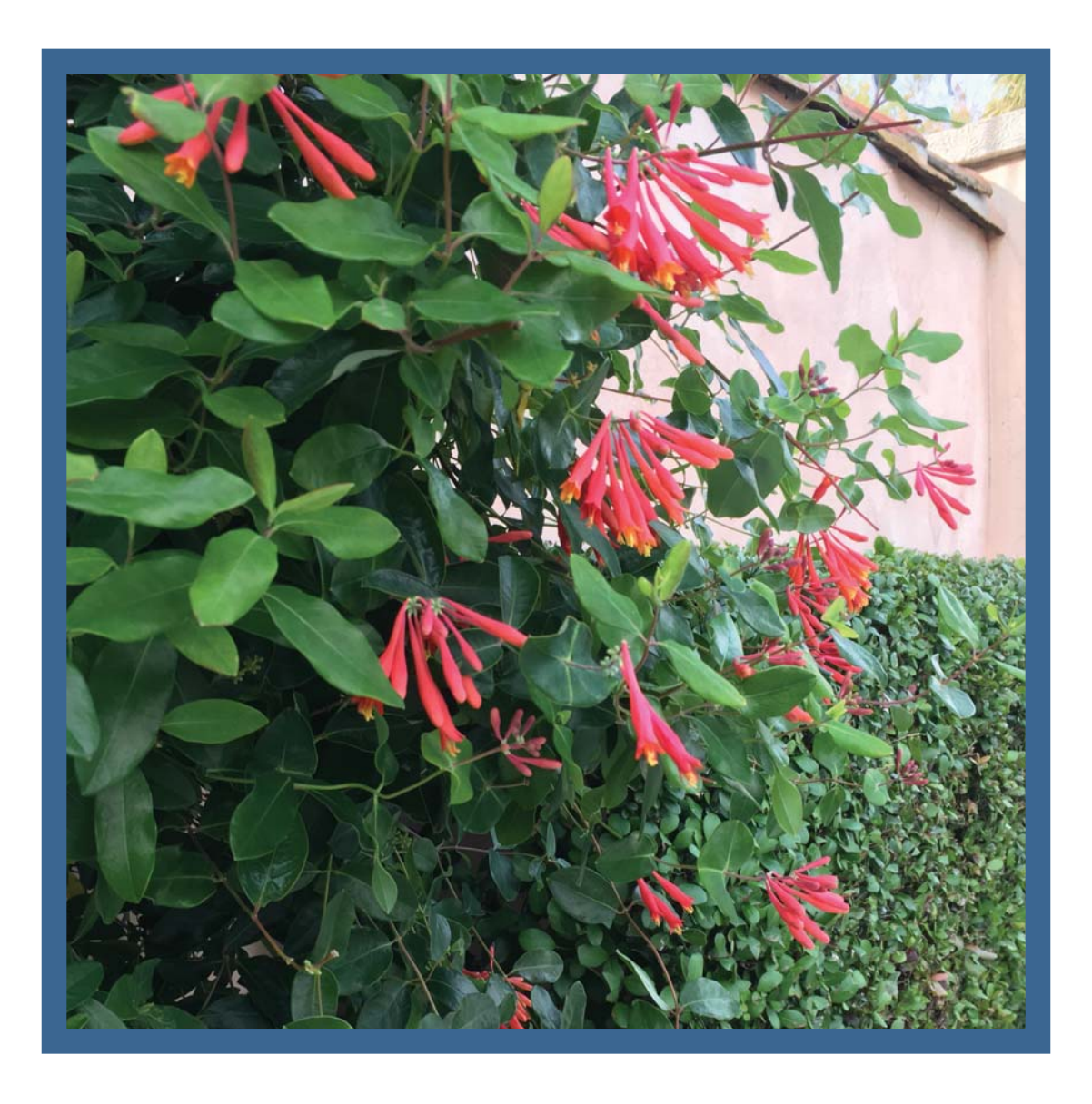
Coral Honeysuckle (Lonicera sempervirens) Pan's Garden by Elizabeth Dowdle

Carolina Jessamine (Gelsemium sempervirens) Coral Honeysuckle (Lonicera sempervirens) Corkystem Passionflower (Passiflora suberosa) Crossvine (Bignonia capreolata) Purple Passionflower, Maypop (Passiflora incarnata) Skyblue Clustervine (Jacquemontia pentanthos) White Passionflower (Passiflora pallens) Wild Allamanda (Pentalinon luteum)