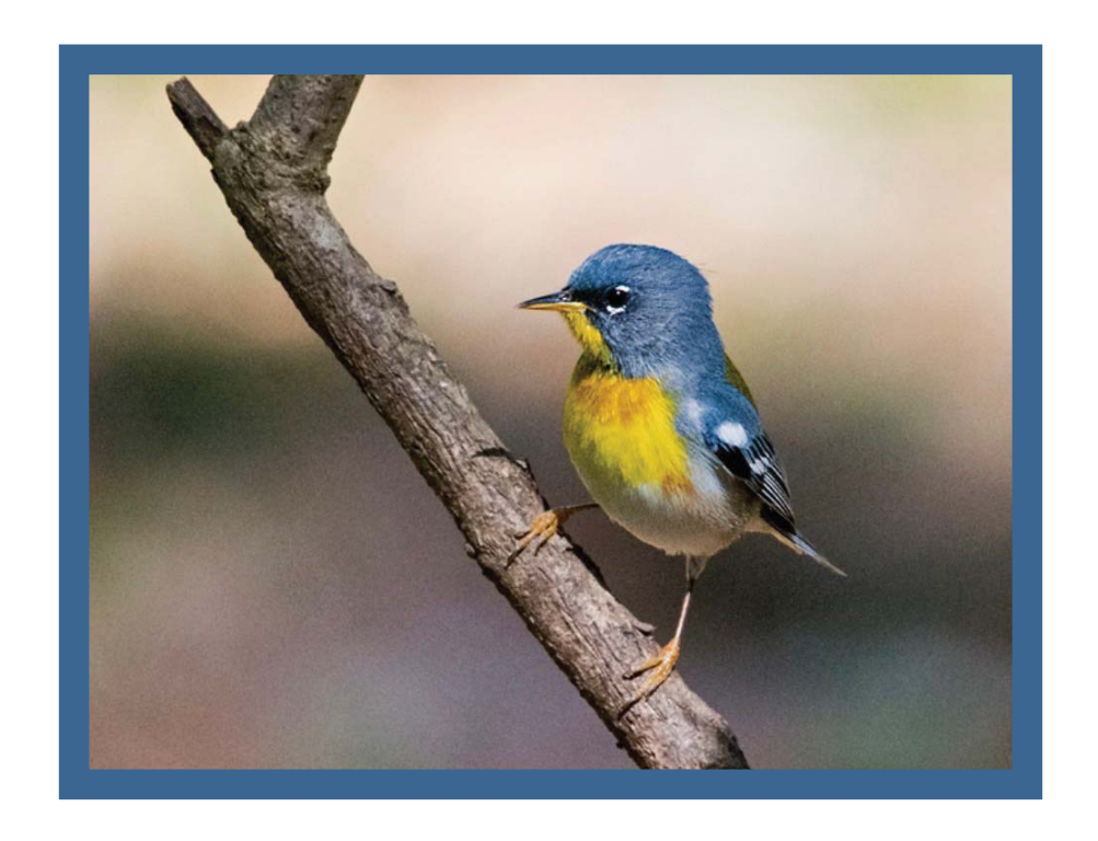
ParulaWarbler