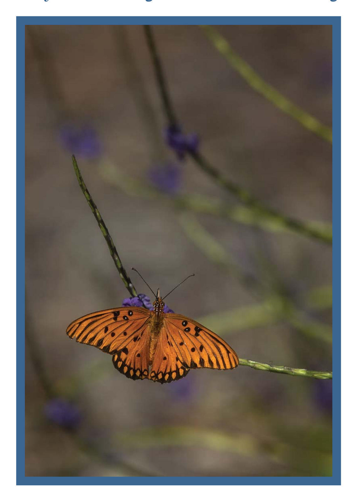
Gulf fritillary (Agraulis vanillae) Porterweed (Stachytarpheta jamaicensis)