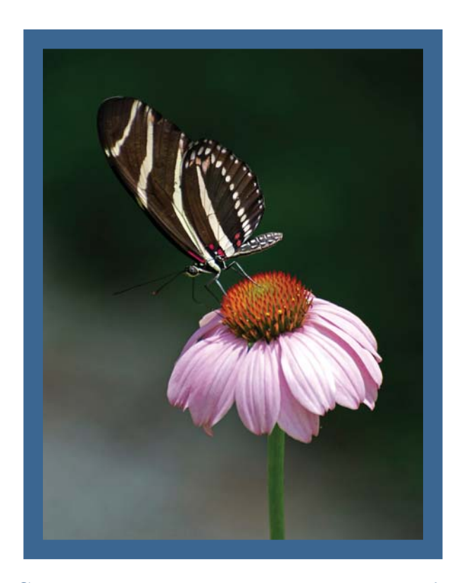
Purple Coneflower (Asteraceae compositae) Zebra Longwing by Barbara Woodmansee