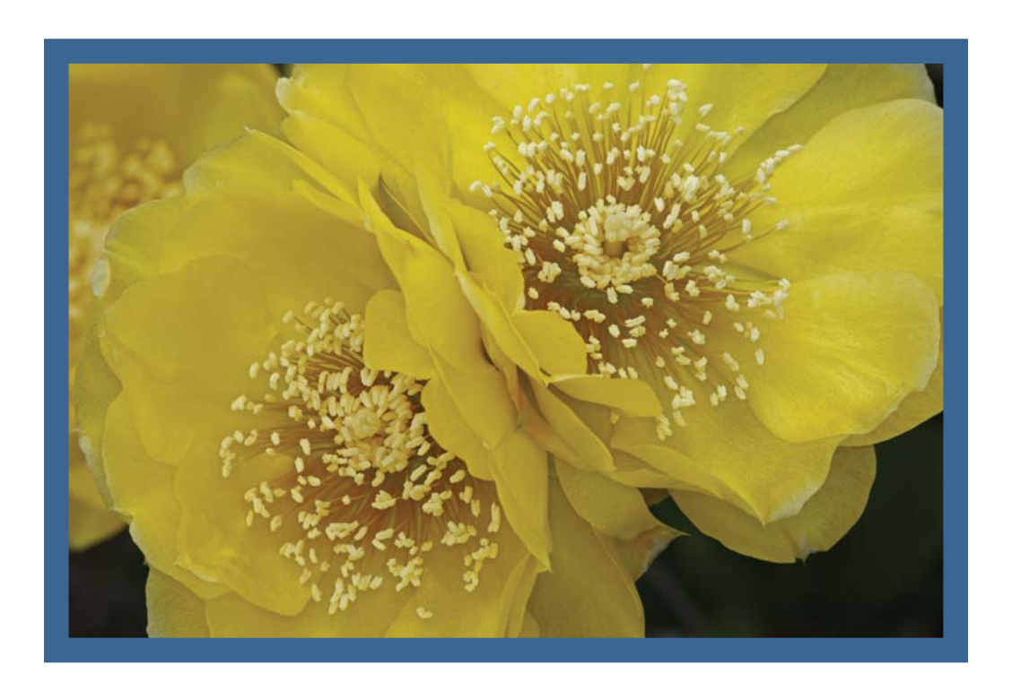
Prickly pear cactus (Opuntia bumifusa)