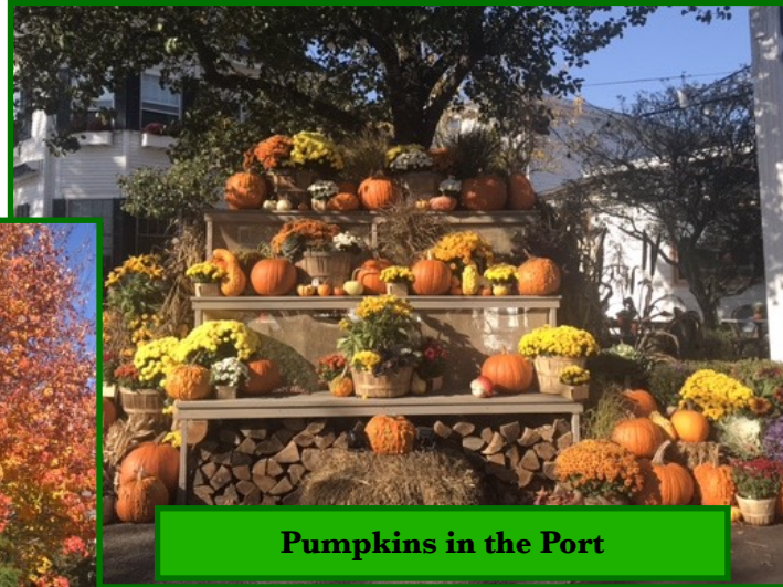
Pumpkins in the Port