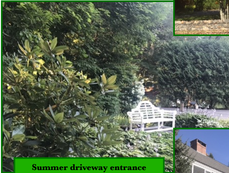
Summer driveway entrance