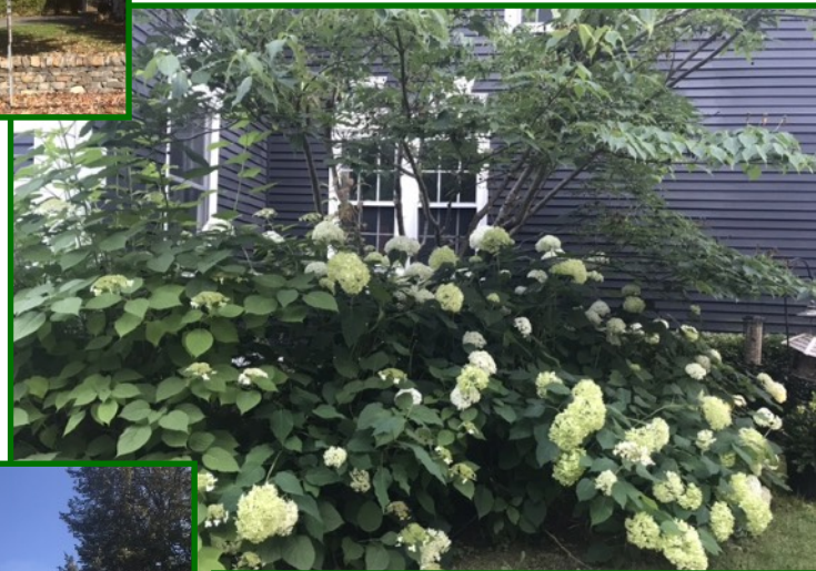
Summer hydrangea in the side yard