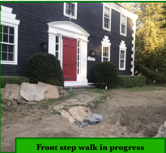
Front step walk in progress