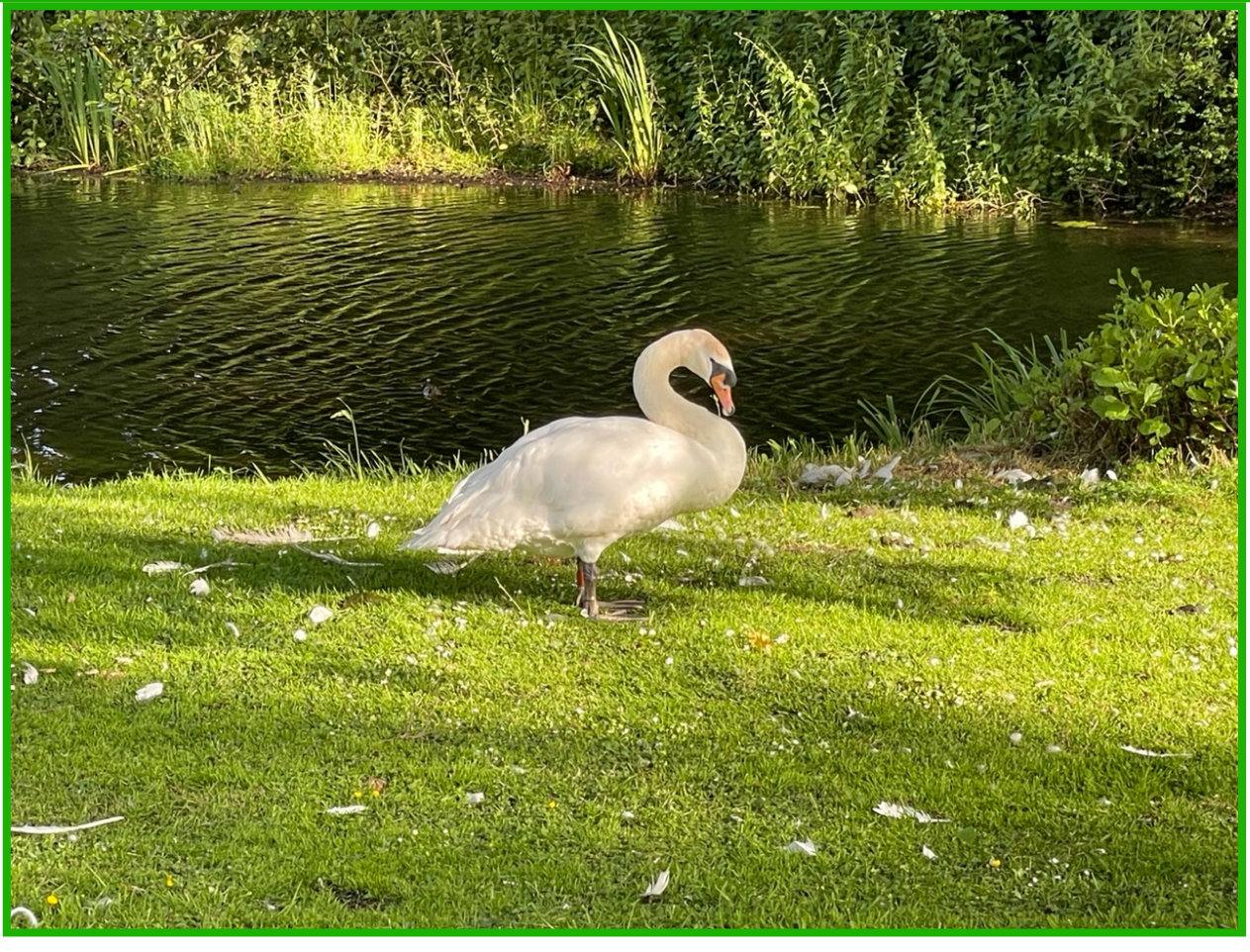
* a lucky goose