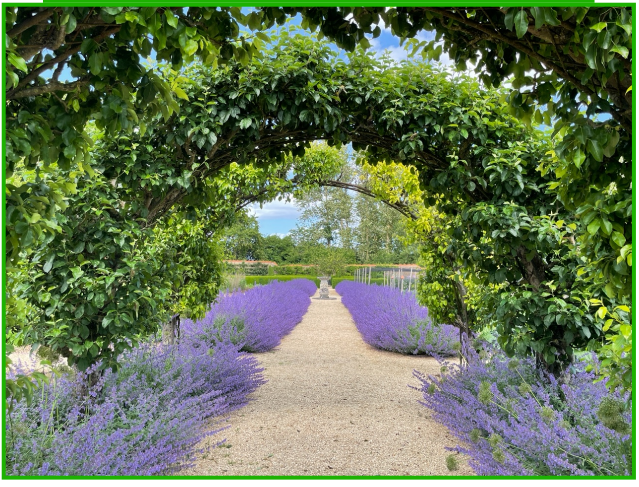
Kim's Day 2 will come to you shortly. Please stay tuned...