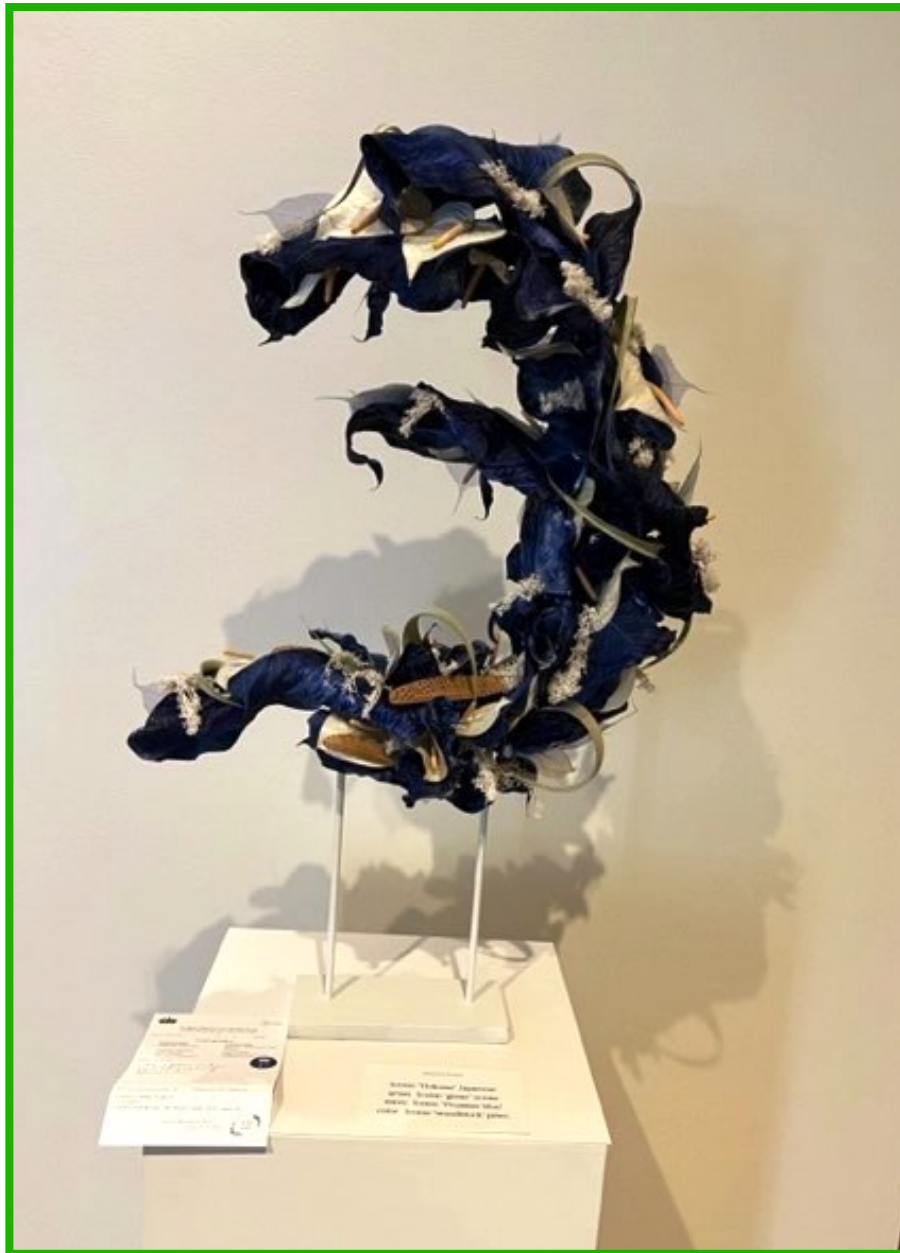
Class 5, Siren Call