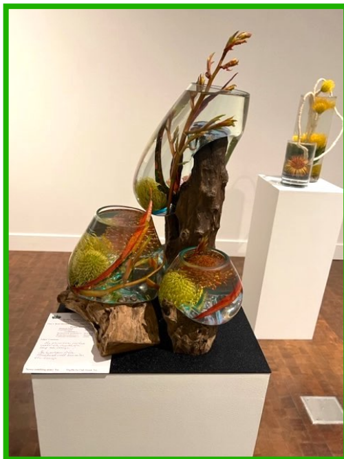
Water Rhythms: an underwater design in clear, multiple containers