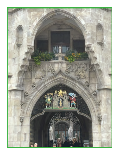
Marienplatz in Munich