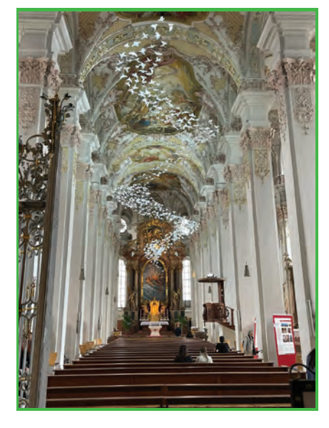
"St. Peter Cathedral in Munich was breathtaking."