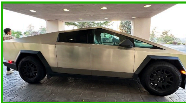
A surprise: a Tesla Cybertruck showed up to send me to ABQ

ABQ to SFO was 6:00 am flight and Santa Fe is an hour away from Albuquerque by car, I stayed overnight the night before at ABQ