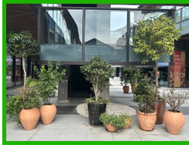
an outdoor mall