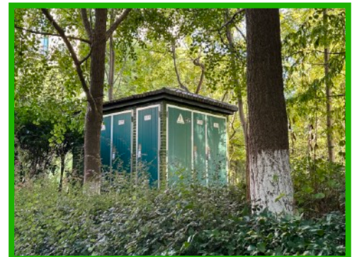
A transformer! The City is relatively newly built, so one does not see many telephone/power lines.