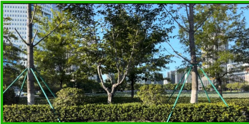
Above: The repeat landscape stretches kilometers & kilometers...