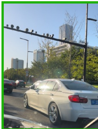
Security cameras literally everywhere but people do not seem to mind and claim the city is entirely safe.

Five days into the country, I decided to join “The Cashless Society” — using cellphone to pay for everything, like everyone else. I could not get around fully with just a stack of Chinese cash with me. Amex was very good to check with me first three days to make sure that all the charges were legit.