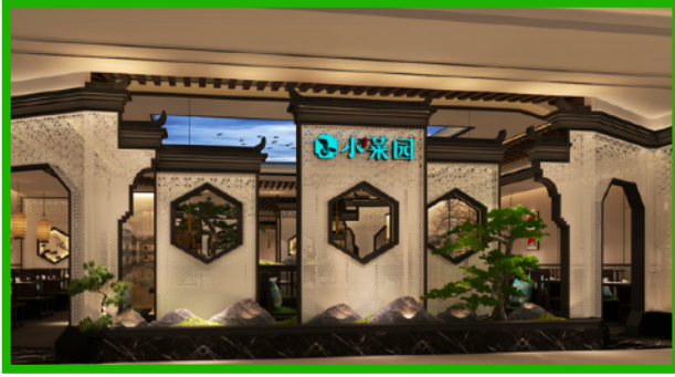
I like this restaurant Little Garden