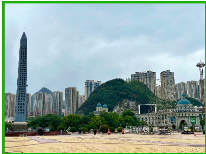
Above: People's Square