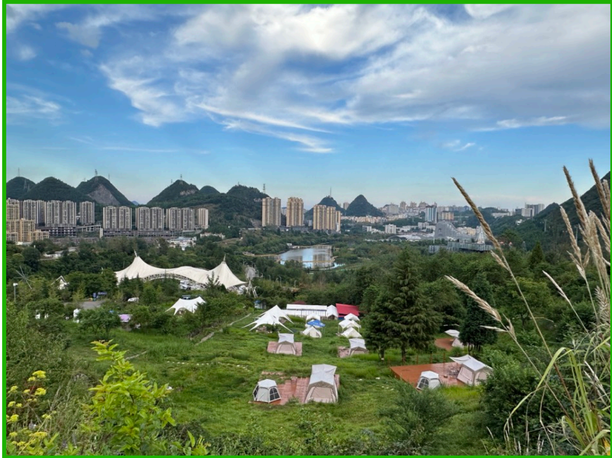
Whole area from another angle