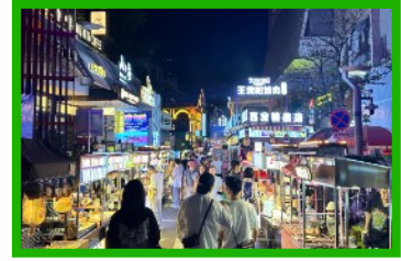
another night market

Guizhou's sheer number of cigarette smokers in public was staggering, from young fashionable people to old farmers and in between. Cigarette smoke permeated everywhere.