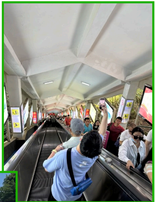
Above: “the World’s Longest Escalator” at 170 meters ( 0.11 miles )