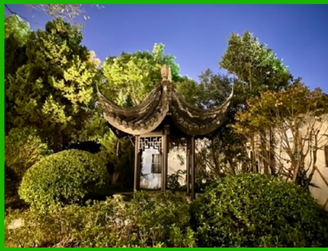
WenFeng Park 文峰公园 on the evening of the Moon Festival. Very few people were out.