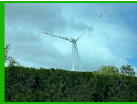
It was 89°F outside