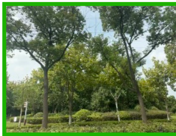
more city scapes