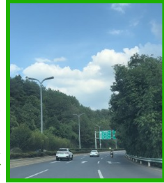
R: the road to Guiyang Airport is lined with beautiful trees, miles long

Back to Dad's home: Typhoon Bebinca, the strongest since 1949, closed two suspension bridges over the Yangtze River for a day.