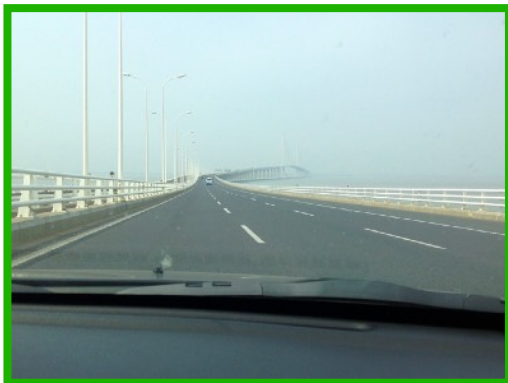
I took this photo May 2015

The Shanghai Yangtze Bridge Construction began: Dec. 28, 2004 Completed: Nov. 8, 2008 Open for traffic: October 31, 2009 Spanning 25.6 kilometers (~16 miles )