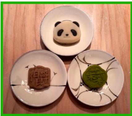
Mooncakes from Sichuan 四川, tea and jasmine flavor

I was told that nowadays people have such fast-paced lives that they do not have much free-time.