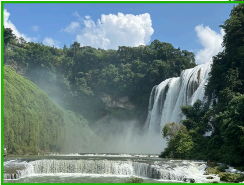
L: The waterfall can be viewed from different angles. We skipped viewing it from the underneath...