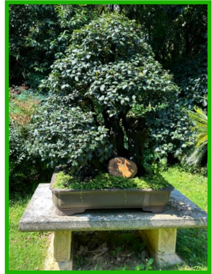
The bonsai garden 盆景区 inside the park was a sheer delight